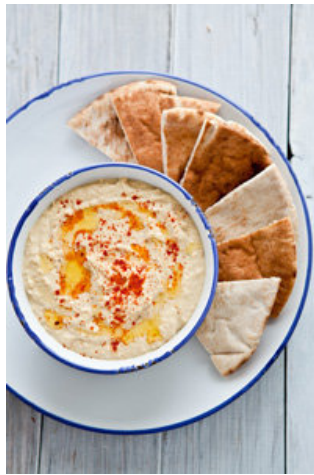
Hummus (click for photo information and recipe)