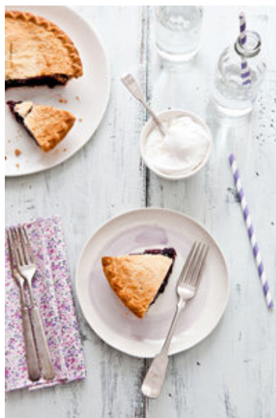
Blackberry Pie ( click for photo information and recipe )