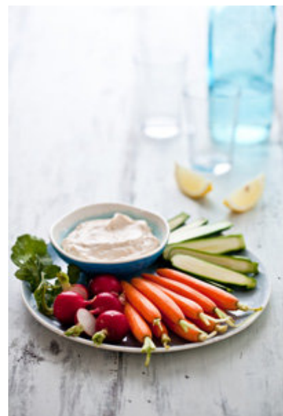
Crudites with Aioli ( click for photo information )