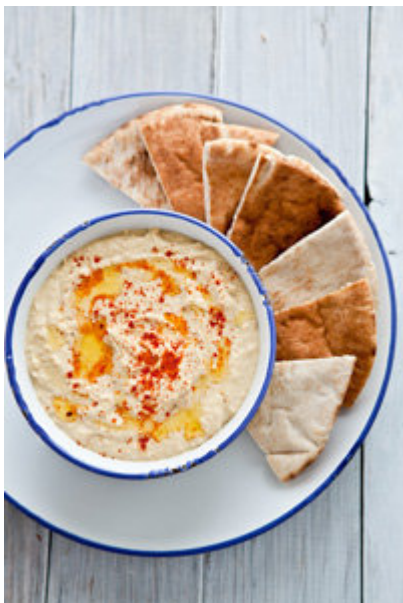
Hummus ( click for photo information and recipe )