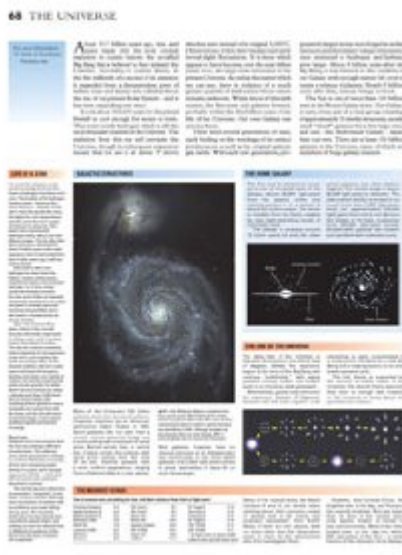
P 68- The Universe. This page is included within the section of the Atlas of the World dedicated to the universe