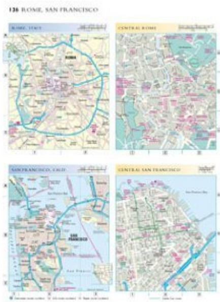
P 136 – Rome & San Francisco town plans. This image shows maps of the cities of Rome and San Francisco.