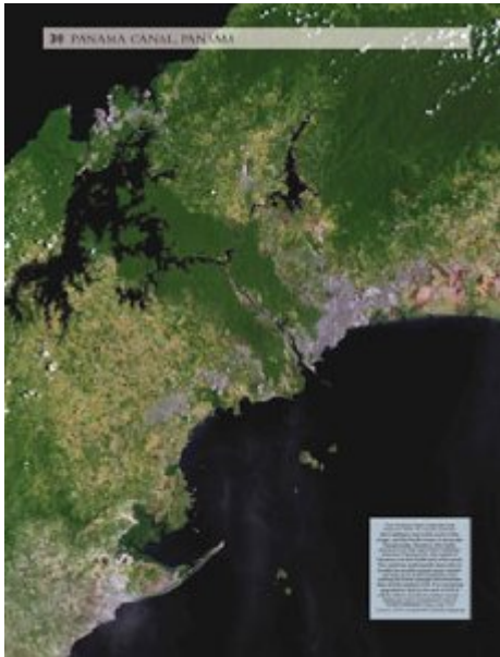
P 31 Panama Canal, Panama. This image shows a map by NPA Satellite Mapping of the Panama Canal. Originally dug between 1904-1914.

A Look Inside: The World Atlas [Click Images to Enlarge]