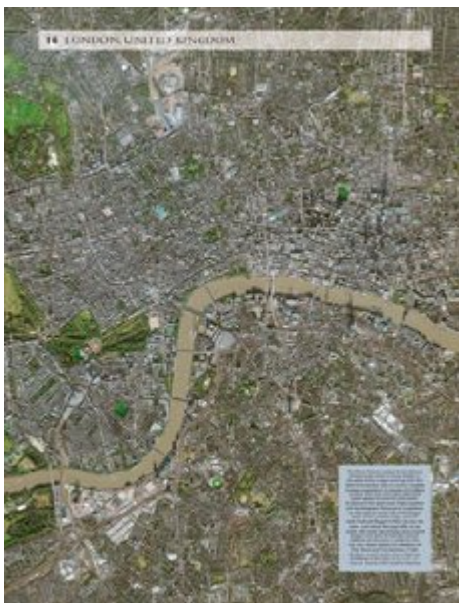
P16 London, United Kingdom. The River Thames snakes from Chelsea Bridge in the west to Tower Bridge in the east in this image covering both the West End and the City of London.